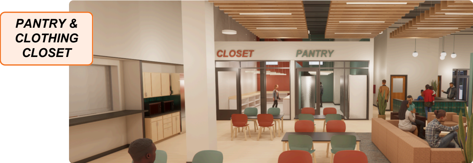
PANTRY & CLOTHING CLOSET