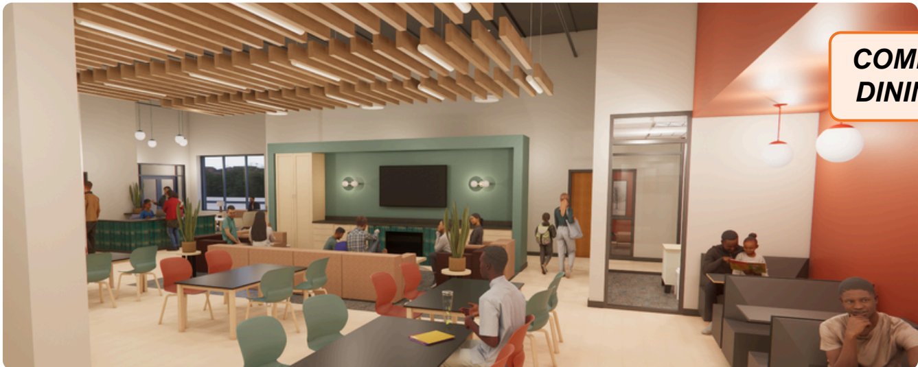
COMMUNITY & DINING ROOM