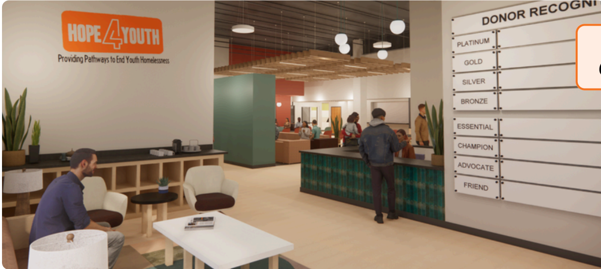
HOPE 4 YOUTH CENTER LOBBY